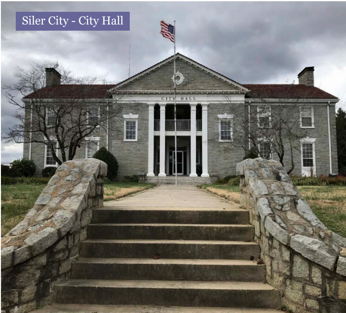
Siler City - City Hall