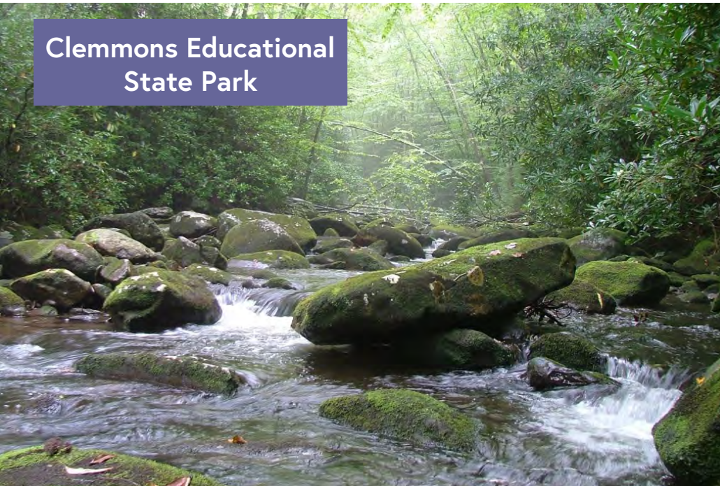
Clemmons Educational State Park